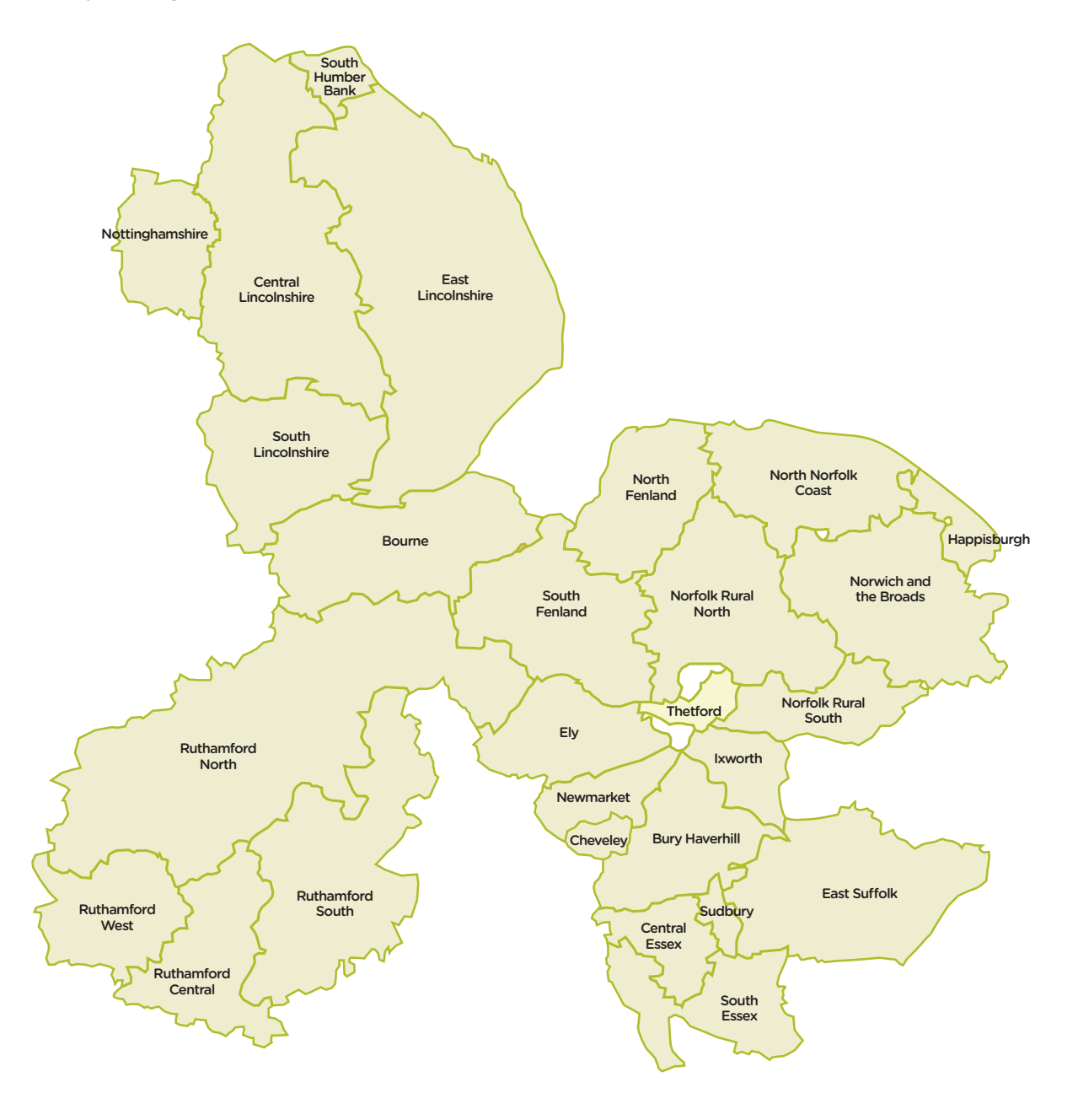
Figure 2.1: Map of Anglian Water's Water Resource Zones

Figure 2.1 shows a map of Anglian Water's Water Resource Zones defined at WRMP19, each of which has its own Market Information Table. A shapefile is also published for each WRZ online, showing the precise WRZ boundary.