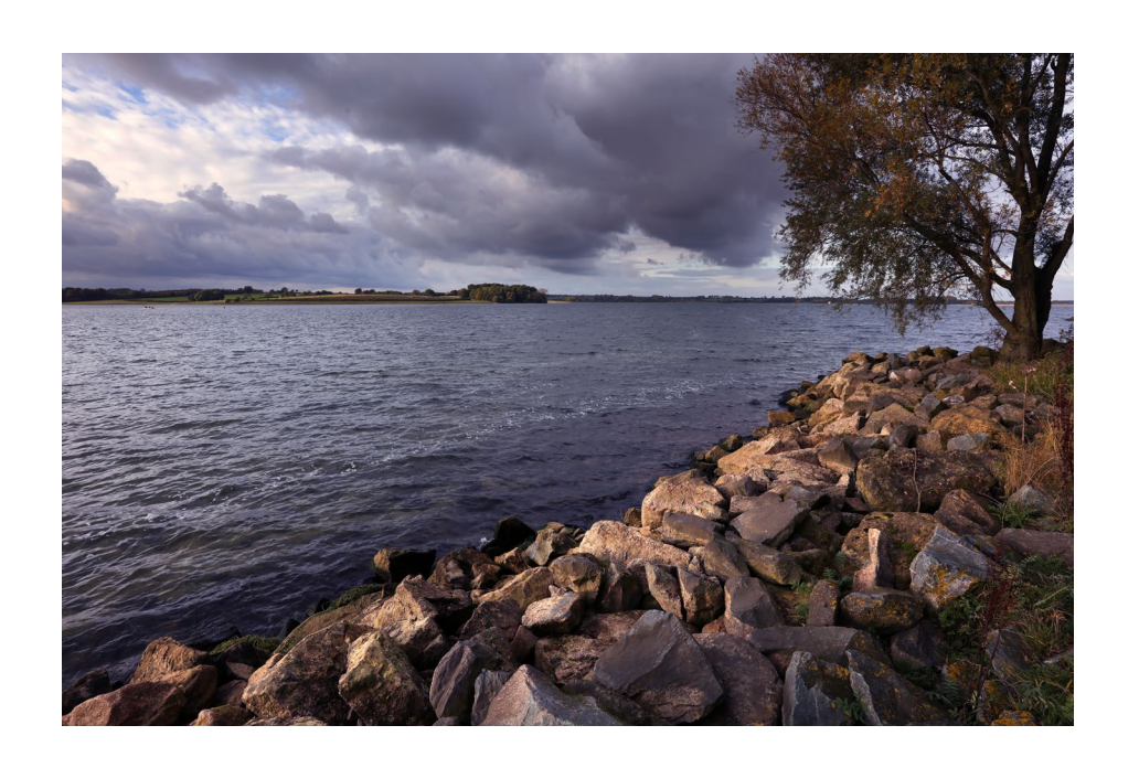
Cover photo - Anglian Water's Rutland Water reservoir, a 1,555-hectare biological Site of Special Scientific Interest (SSSI), east of Oakham in Rutland. It was designated a SSSI in 1984.