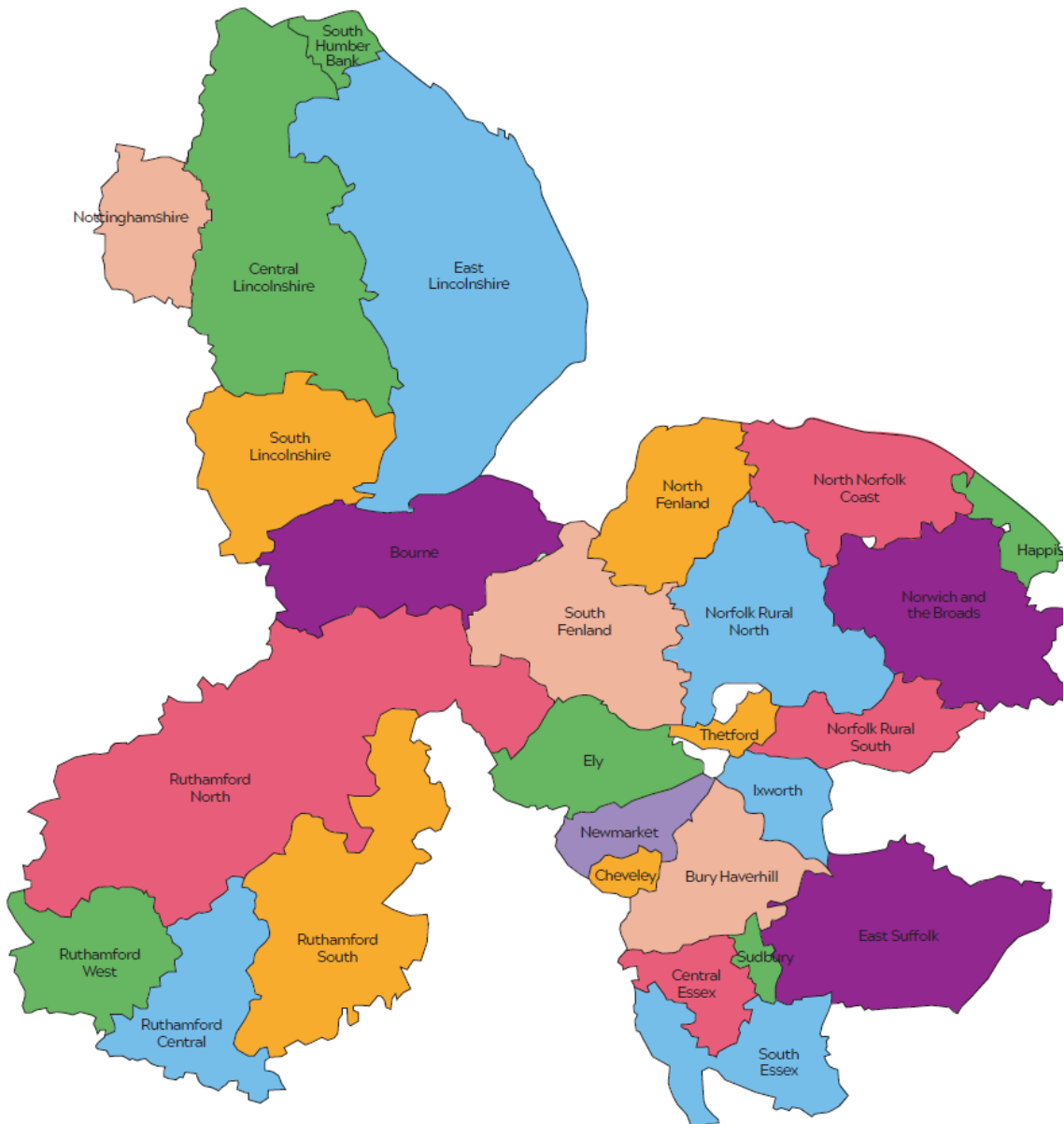
Figure 2: WRZs in the WRMP