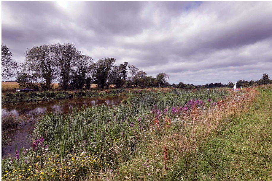
Cover photo - Anglian Water's first wetland treatment site, on the River Ingol in west Norfolk. The wetland has been created in partnership with the Norfolk Rivers Trust and forms part of Anglian Water's Water Industry National Environment Programme (WINEP).