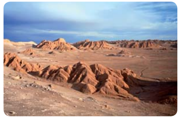
The driest place in the world is the Atacama Desert in Chile, which had no rain for 400 years from 1571 until 1971.