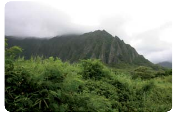
One of the wettest places in the world is Mount Wai'ale'ale in Hawaii, which has an average rainfall of 1,143 centimetres per year.