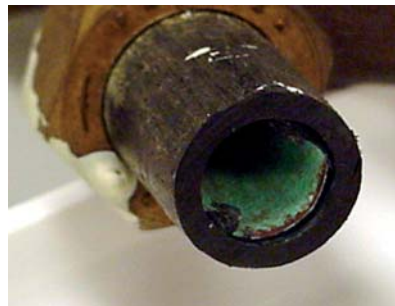
Green coloured limescale inside copper pipe

Please call us for advice on our Approved Plumbers list on 08457 145 145 or visit our website www.anglianwater.co.uk .